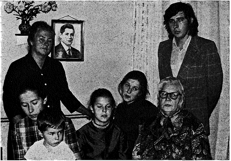
The family of the imprisoned reform Baptist leader, Georgi Vins, whose autobiography is reviewed on p. 42. His wife stands beside the portrait of her husband and his mother is seated on the right.