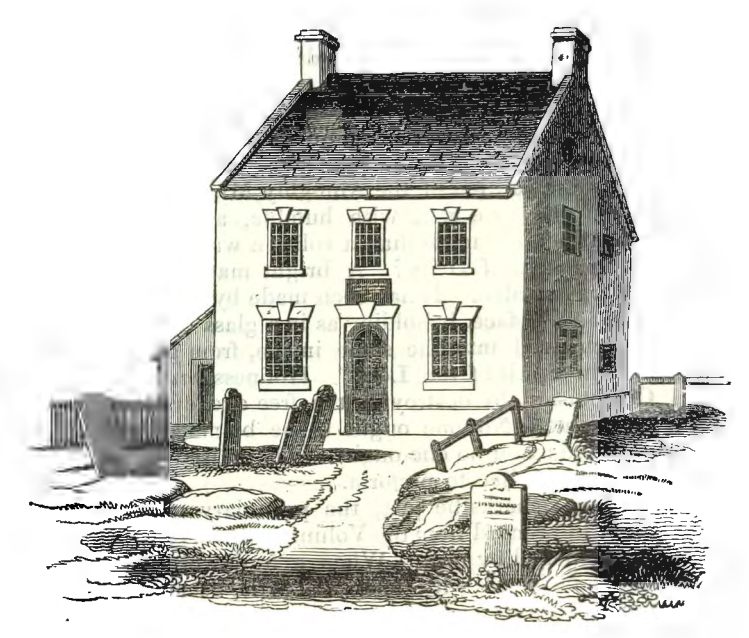
BARTON MEETING-HOUSE.—See page 222.