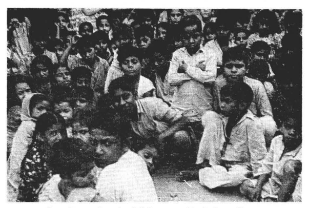
Sunday school children at Dehri-on-Sone.