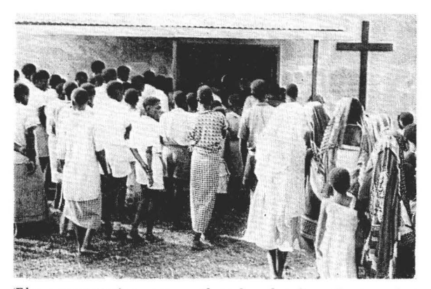
The congregation enters the church after the opening ceremony.

But what now? The heavy rains are on us now, so we watch the building to see if our methods will