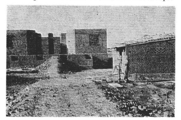
Progress is being made in erecting the new church at Dehri-on-Sone.

Throughout this article we have been able to repro-