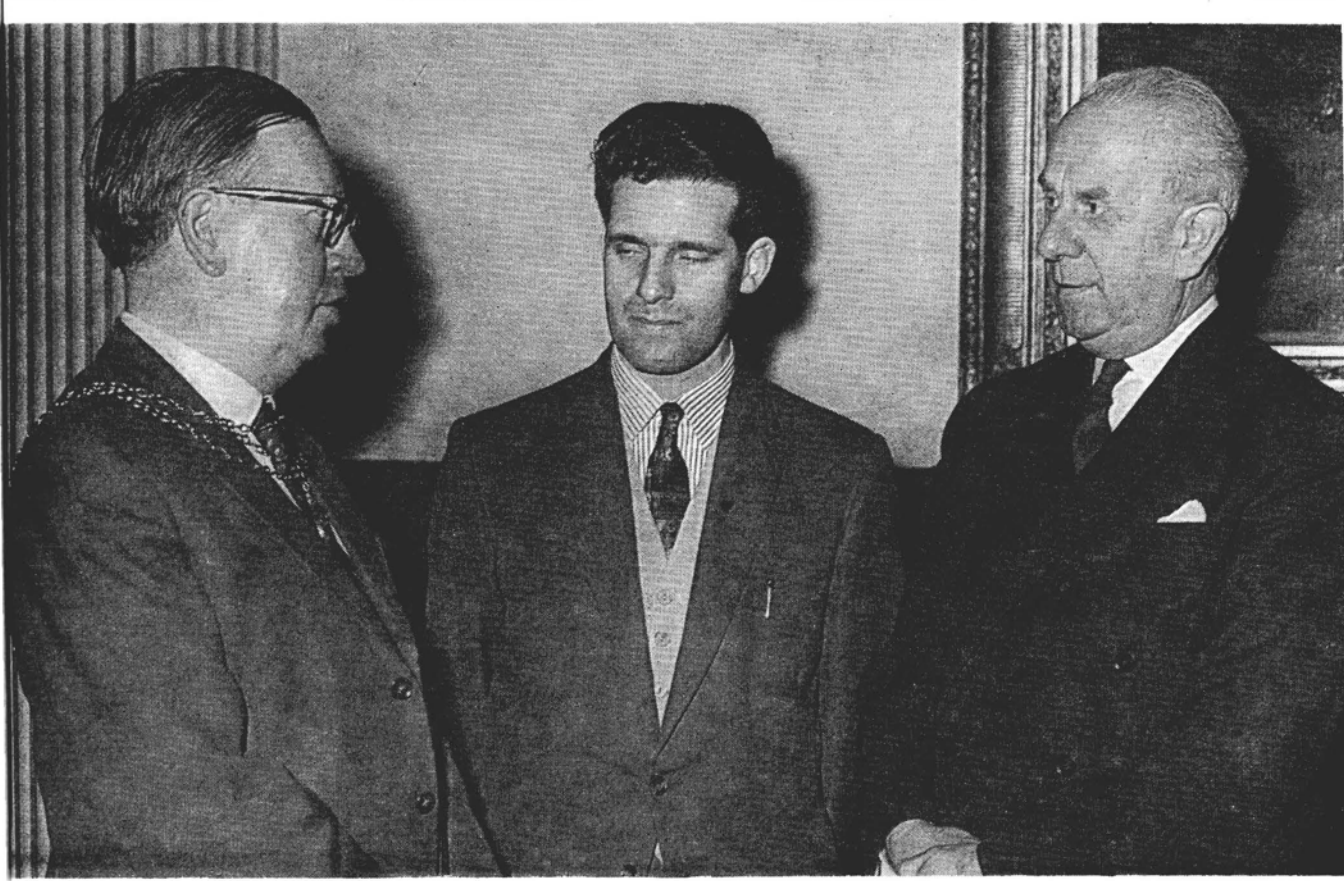
Vol. XLIV No. 26 JUNE 29th 1963 6 6