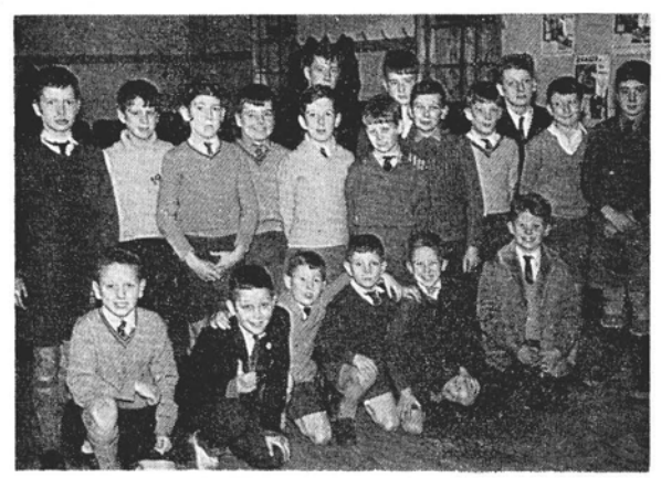
Paisley boys' team No. 1.

From among these lads new scholars have been introduced into our church Sunday school, and occasional visits to the church have been arranged when special features have been planned. It has been most encouraging to see the response shown by these lads to this project; although it is very sad to see the amount of darkness which prevails among them. This