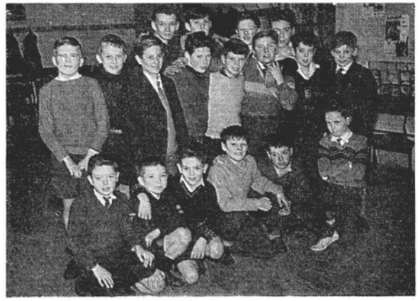
Paisley boys' team No. 2.

constitutes a great challenge to us to which we are determined to rise. Elim needs more boys and we must encourage every youth department to do something to enrol more of the men of tomorrow. At the recent Bristol youth conference the main emphasis was on this very point. We want every Elim church to launch a special boys' night in their church or on a housing estate. A full list of activities for boys can be had from headquarters. Now is the time to apply for the use of halls, and then in the latter part of the year we will be ready to launch this great venture. It is proposed that October be a special youth month and that these boys' nights be commenced then.