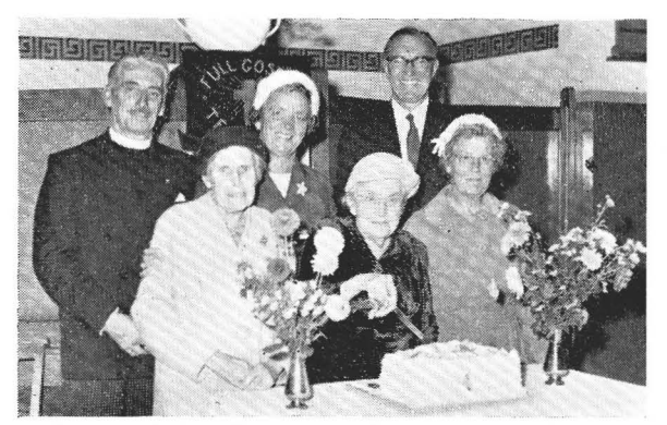
Cutting Clacton's twenty-fifth anniversary cake.