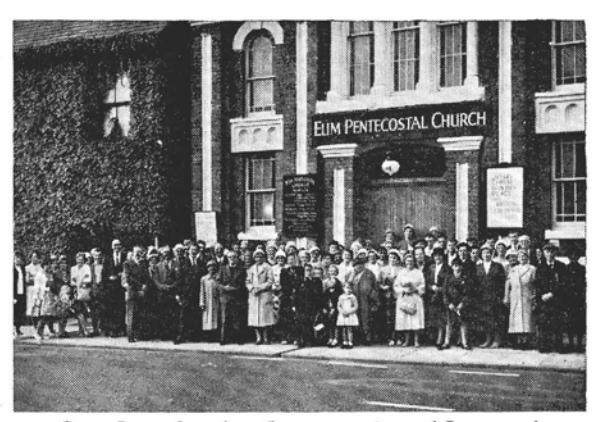
Crowds gather for the reopening of Lowestoft minor hall.