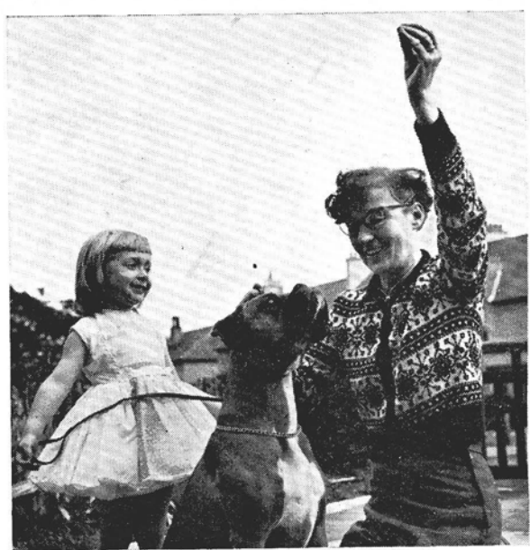
Healed of a "frozen" shoulder.

As the third week of the crusade began Pastor Tee devoted each evening to Bible teaching so that