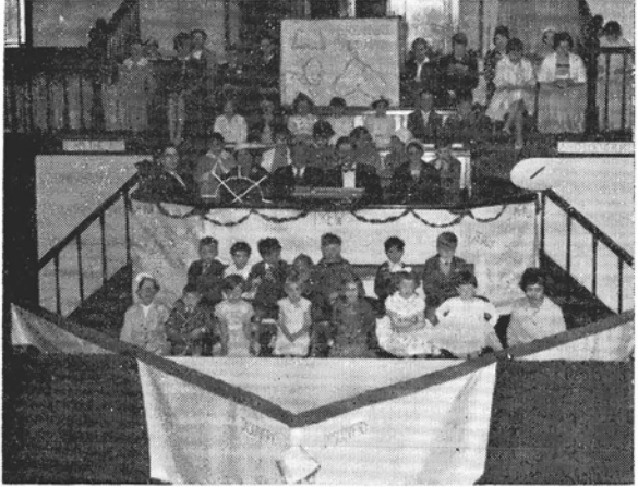
Glossop Sunday school demonstration.

This year's Sunday school anniversary took the form of a dialogue entitled "The voyage of discovery." The pulpit and surrounding area was transformed into the bow of a ship, complete with compass, map and wheel, and with appropriate texts.