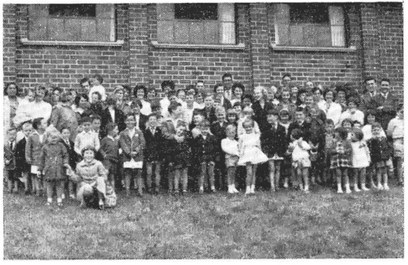
Larne Sunday school annual outing.

Many happy memories surround a Saturday in July for the pupils, parents, teachers and friends of Larne Elim Sunday school, for this was the day of the annual Sunday school outing. This year a party of some ninety children and adults travelled by special coaches to the seaport of Carnlough. The Lord graciously blessed us in every arrangement and detail.