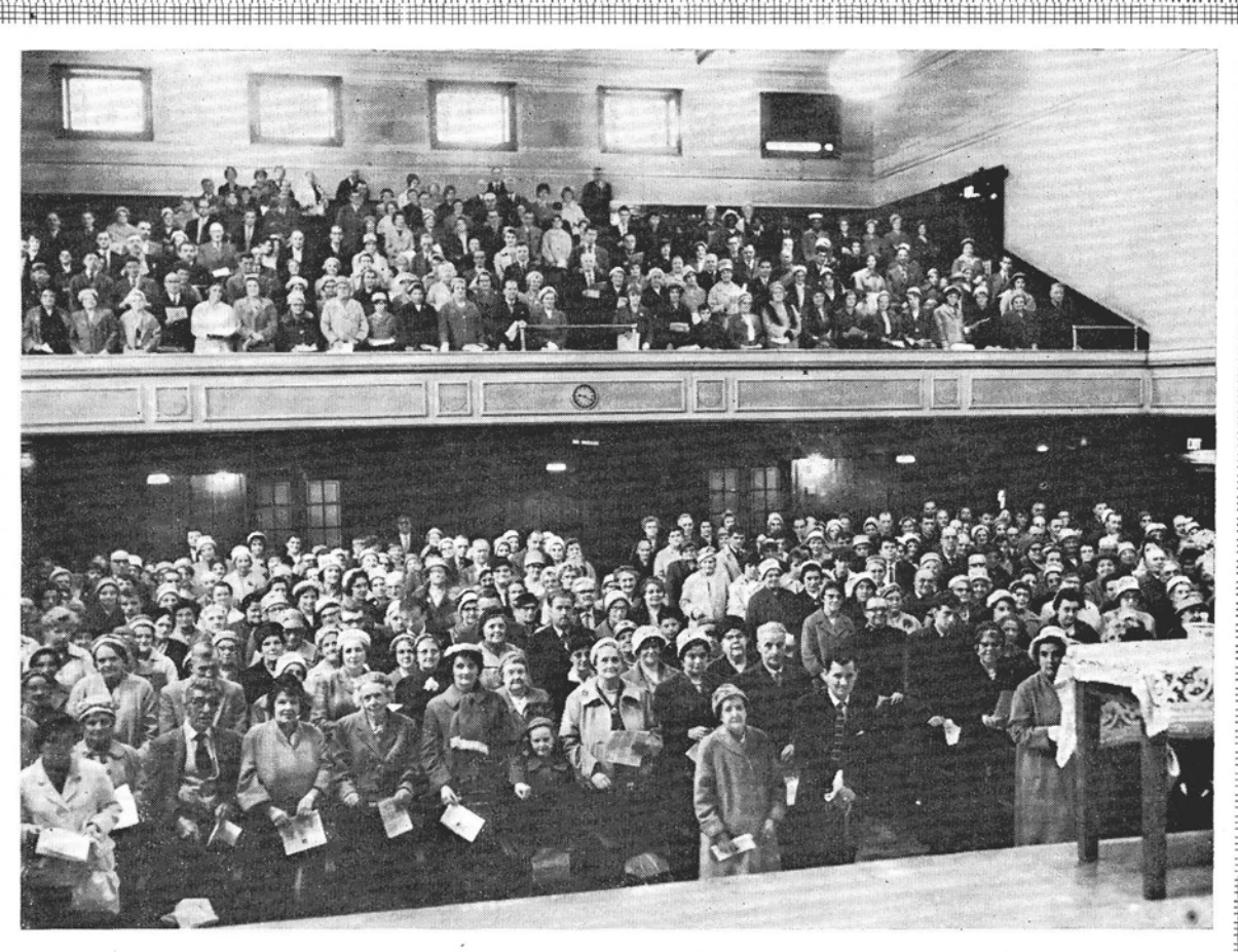
PART OF THE GREAT CONGREGATION WHICH FILLED SOUTH GOVAN TOWN HALL FOR THE OPENING NIGHT OF THE CRUSADE. (See page 594)