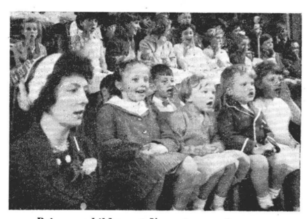
Primary children at Nuneaton anniversary.