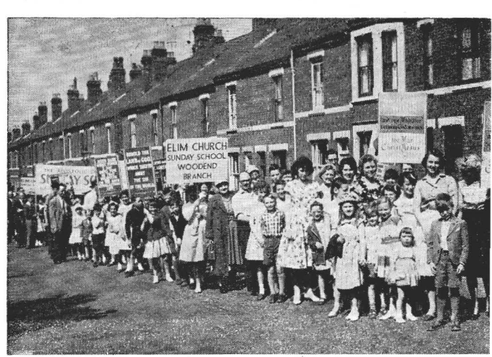
By courtesy of