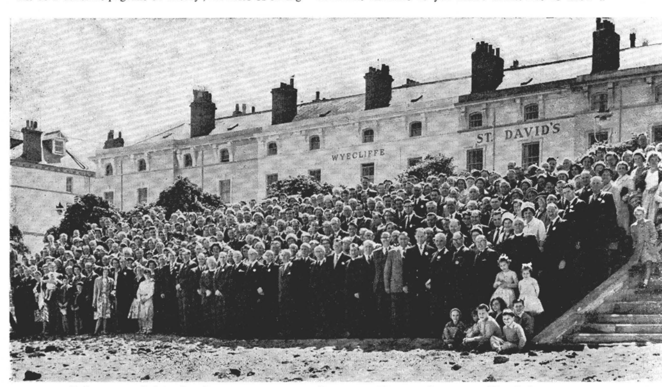
Delegates and friends who were present at the recent Elim conference at Llandudno.

I intended a third line of thought: "The discipline of God over the ministry." Time forbids me even beginning it. Brethren, but one motive is sufficient for our task, that is love for Christ and His cause. Link your little life with the love of Christ for the duration of your days, and when day is done and shadows fall the gates will be lifted up, the doors will open wide and you will have an abundant entrance as you arrive home. Let us know a