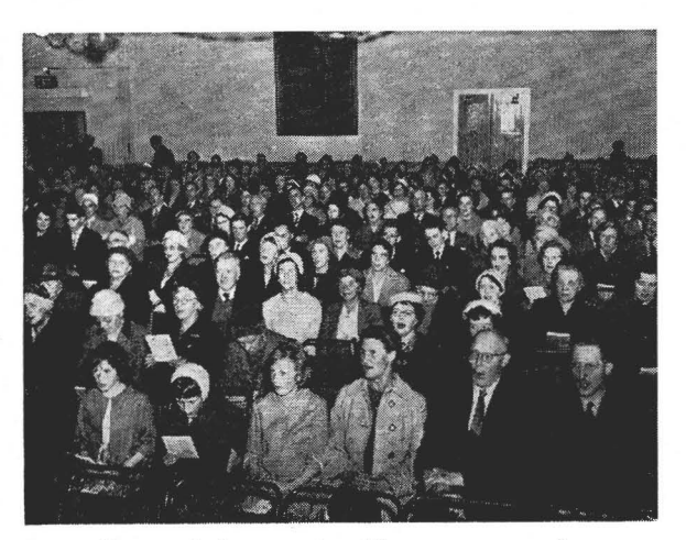
Some of the crowd at Worcester crusade.

FOR some time the church at Worcester had been exercised about holding a city-wide crusade to bring our work more to the notice of the 64,000 inhabi-