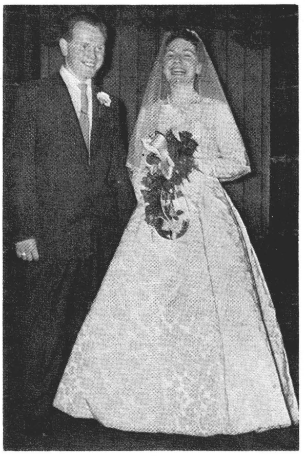
More wedding bells!

Full reports will appear in a later issue.