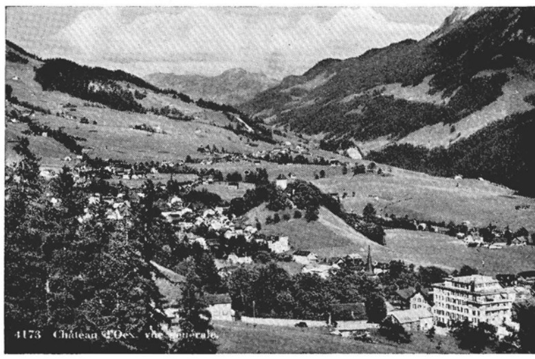
Hotel Rosat and Chateau d'Oex.

Camp or Continental fouse Party mhas the answer!