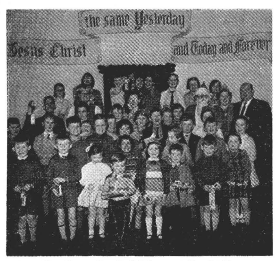
Sunday school children at Banbridge.