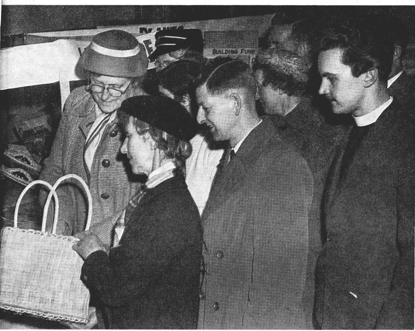
By courtesy of