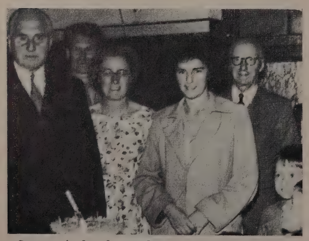
Group of church members at Brixton anniversary services.

Our photograph below shows some of the foundation members of the Brixton church.