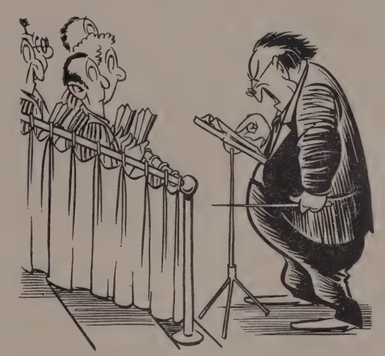
"ALL RIGHT! WHO WAS THE WISE GUY THAT CHANGED' COUNT YOUR BLESSINGS! TO 'COUNT YOUR CALORIES!"

when he first encounters the luxuries of this world: Is it right to do this . . . that . . . and the other? Here is the answer for such a question: "Lay aside every ounce of surplus flesh." It may not be a sin