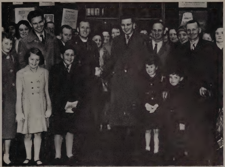
By kind permission of