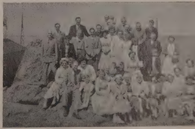
Elim ministers and their families have a day out in Portrush, June 1959.