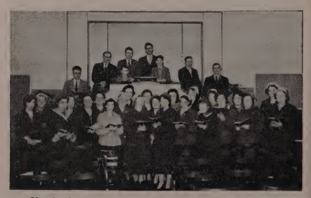
Newly formed choir at Alexandra Park Avenue.