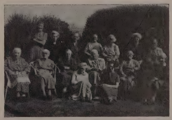
Old folk at Glenfield eventide home, where Bath members regularly conduct services.