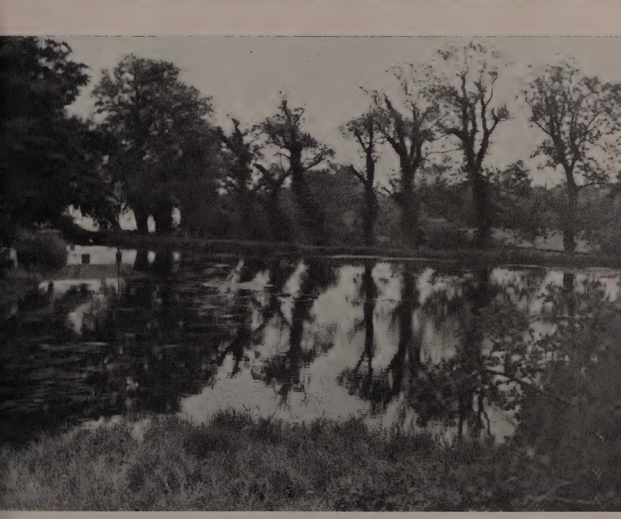
REFLECTIONS IN STILL WATER NEAR SAINTFIELD, CO. DOWN "He leadeth me beside the still waters" (Psalm 23:2)