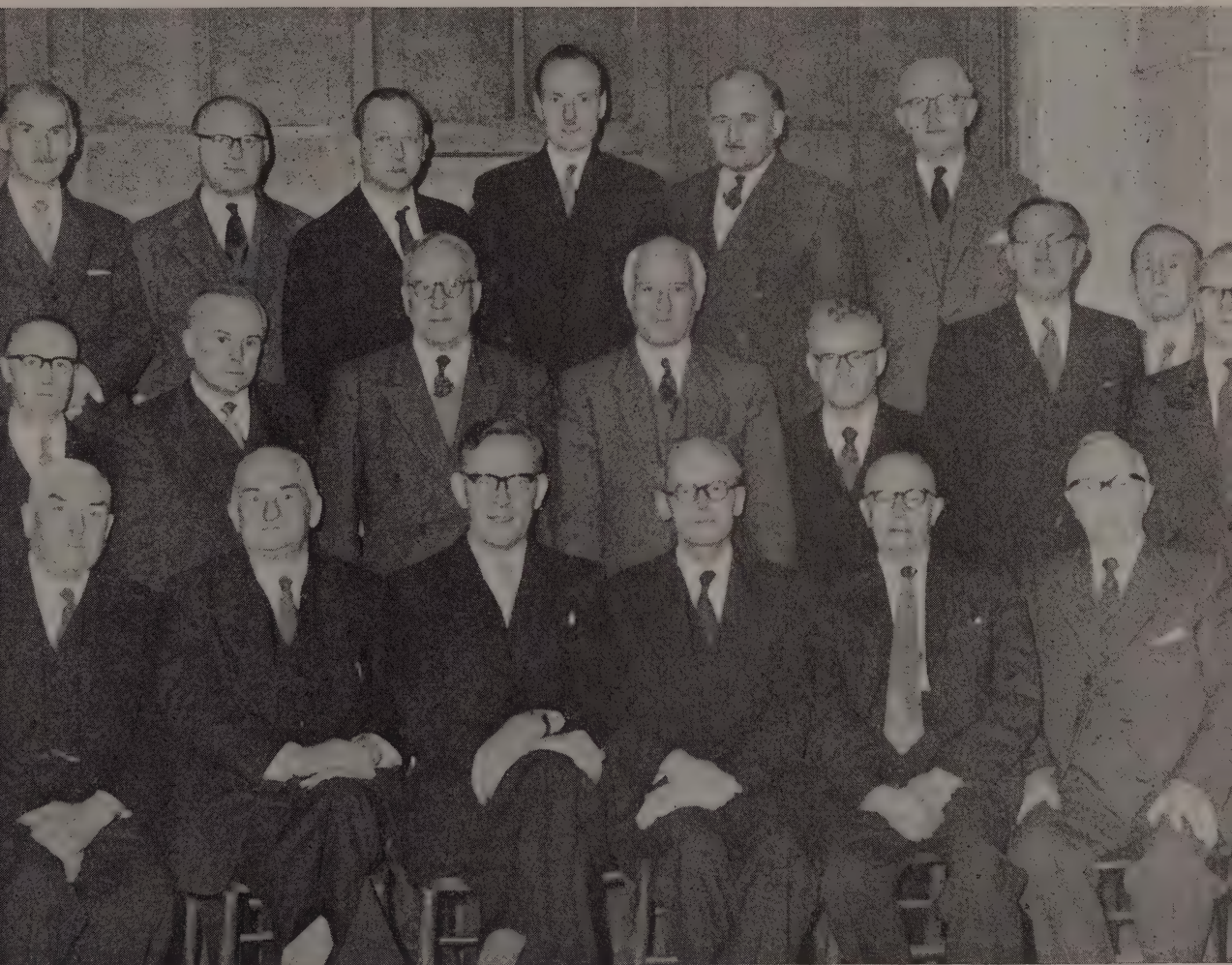
ANNUAL GENERAL MEETING OF THE BRITISH PENTECOSTAL FELLOWSHIP LONDON, 1959