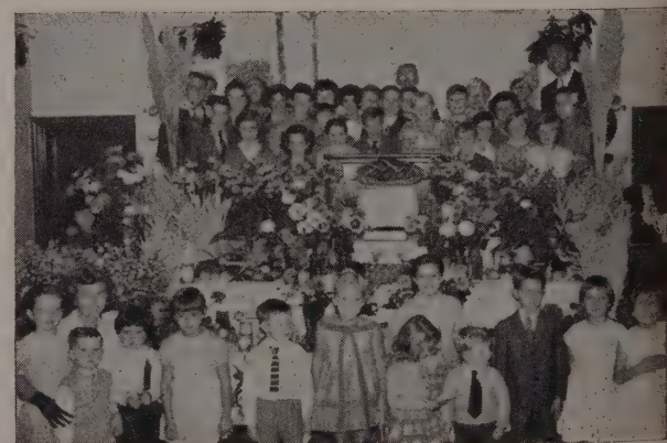
Children's harvest service at Westcliff.