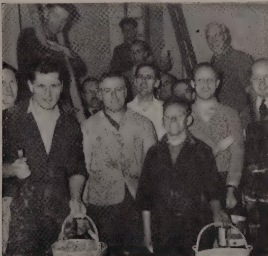
Worcester brethren redecore the church interior.