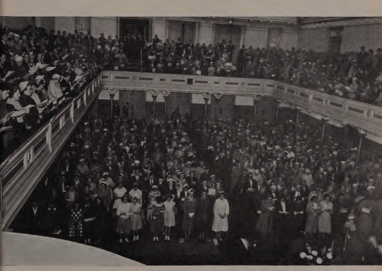
CROWDED GATHERING AT PAISLEY CAMPAIGN