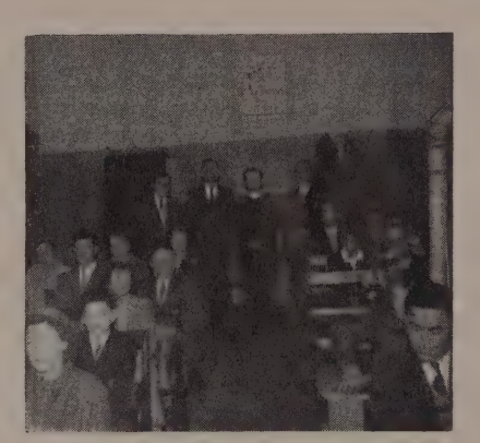
Campaign party and section of congregation at Faringdon.