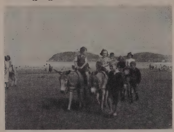
Donkeys, a firm favourite with children, on the sands at Llandudno.

Come to the ANNUAL CONFERENCE at L L A N D U D N O