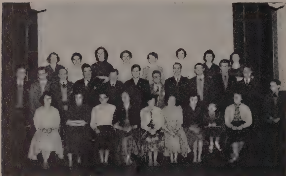
Newcastle Crusader Party