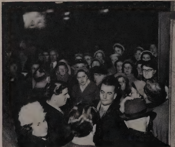
Section of crowd at Treherbert opening