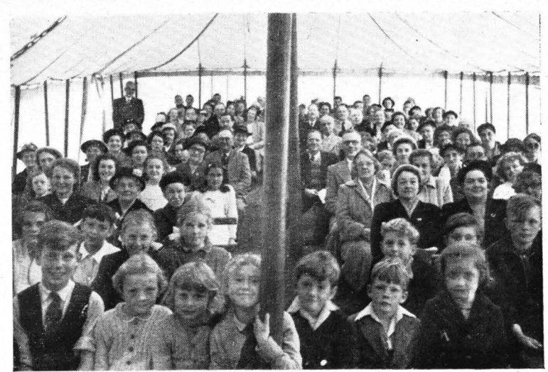
TENT CAMPAIGN AT WEMBURY

Thy fetters bring freedom: Thy poverty brings power: Thy sorrow gives strength; Thy burden begets blessing; Thy blows are Thy benediction; Thy touch transforms my midnight to noontide; Thy smile is my sunshine; Thy Word supplies wings to my thought, and Thy promise is the pledge of performance. Bid me come to Thee upon the waves of my need, and discover Thee afresh 'mid the