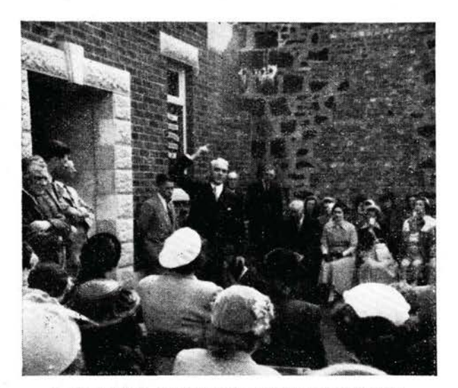
An Elim minister goes into action outside the new building, before the opening ceremony.

The building in Jerusalem, he said, was but a type of