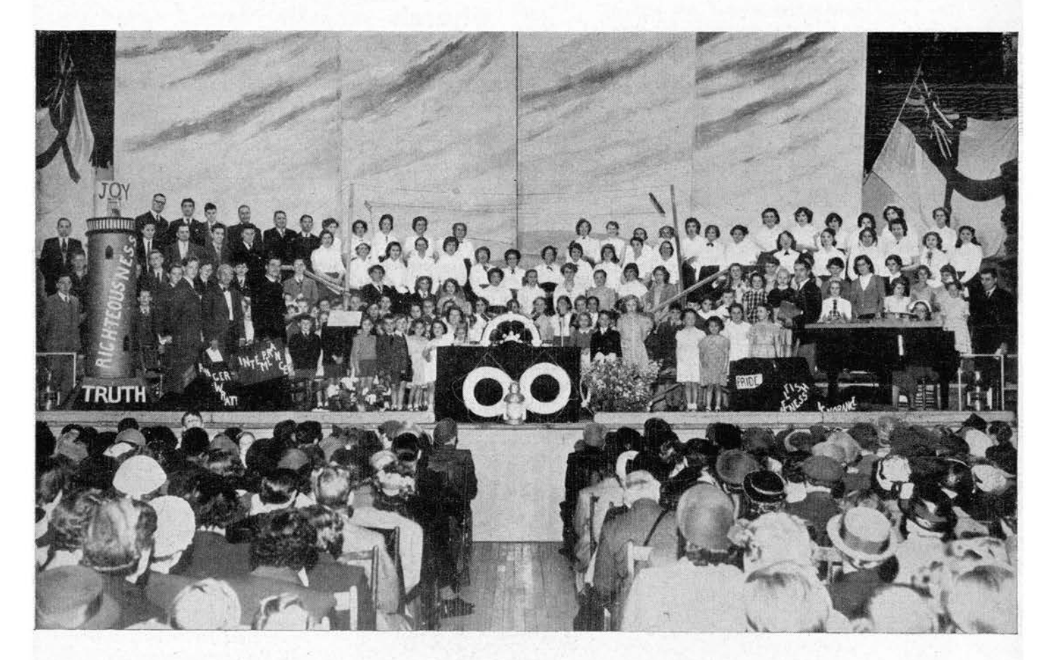
Oxford Sunday School Anniversary in the Town Hall

Witnessing to the fulness of the Gospel of our Lord Jesus Christ