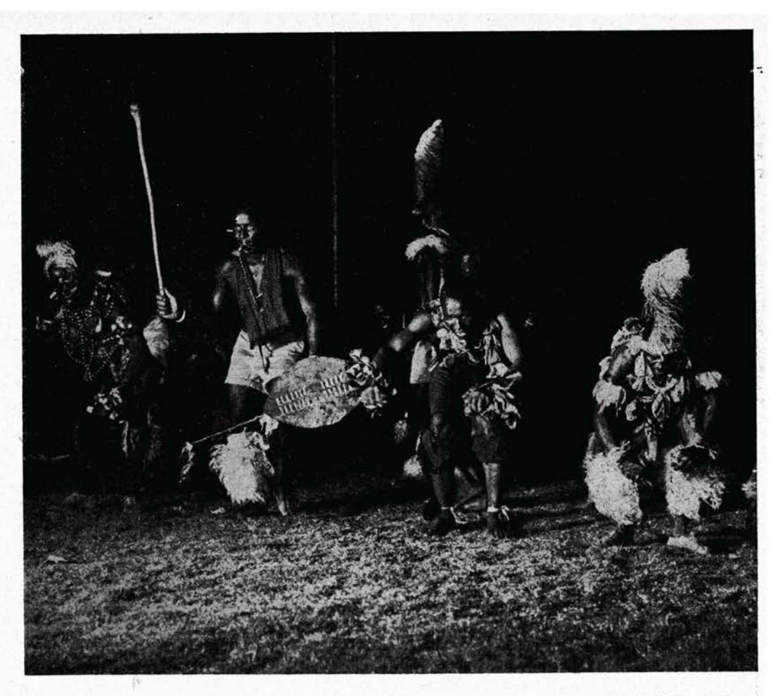
NATIVE WAR DANCERS AT NIGHT

When his twin brother in India, carrying on a similar ministry, braves the torrid, steamy, unbearable climate