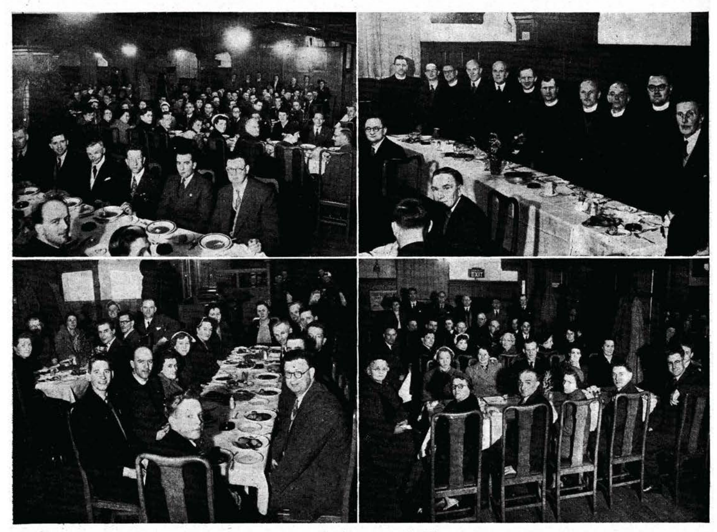
Youth Conference at Cardiff