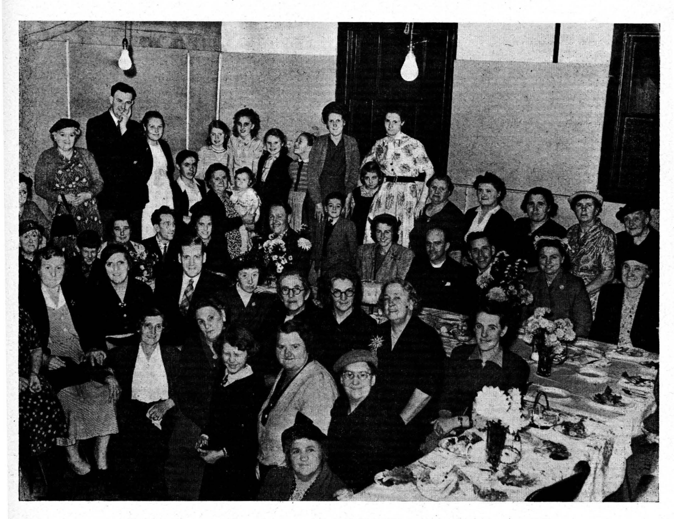
FIRST ANNIVERSARY FELLOWSHIP MEETING OF THE BRANCH CHURCH AT TREHERBERT

Witnessing to the fulness of the Gospel of our Lord Jesus Christ