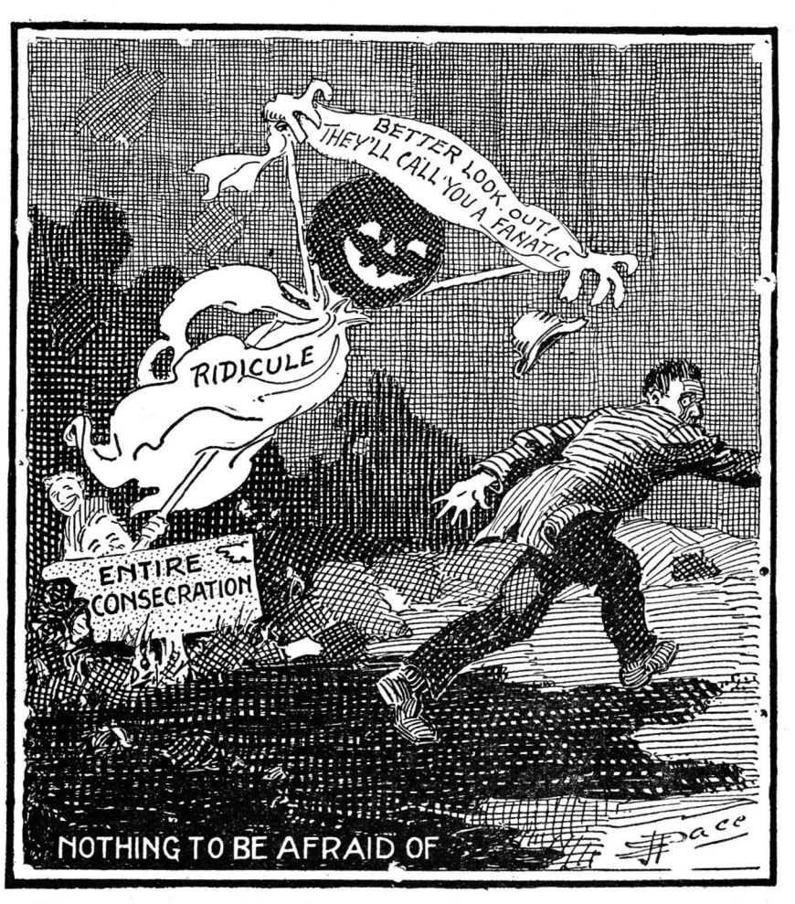
There can be no revival while we fear to consecrate ourselves fully to the service of Christ.