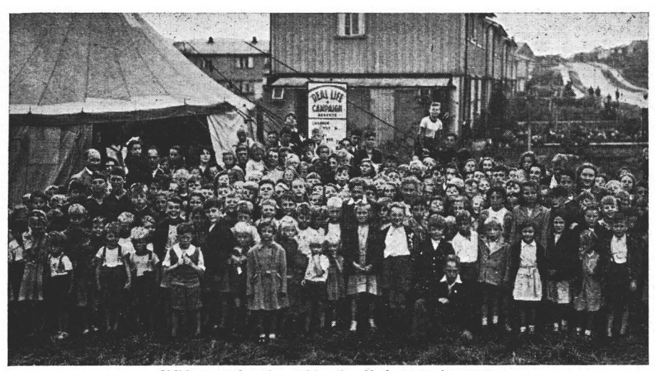
Children gathered outside the York campaign tent.

where to put them, the sides of the tent already bulging. The singing of the choruses was a tonic to the hearers, and the way the children learned them without the