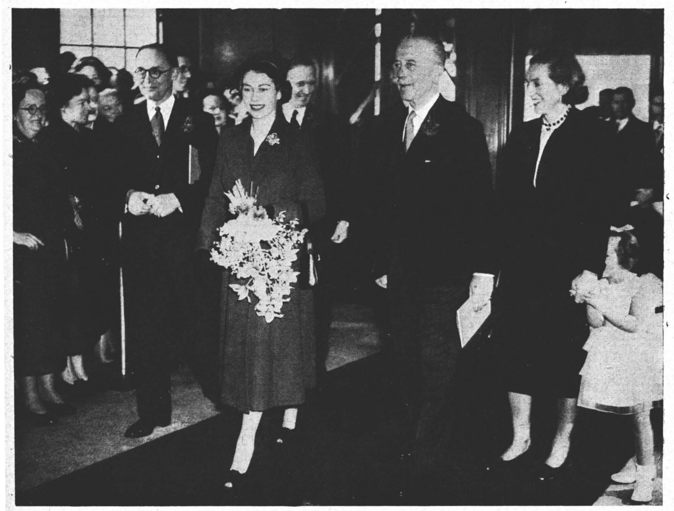
Her Majesty the Queen pays a visit to Broadcasting House. The intimacy of radio will bring the Queen's message to the homes of her people. It is a cause of deep gratitude to God that the moral and spiritual foundations of the British Throne are securely established in the Word of God.