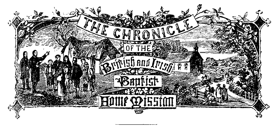
As the Chronicle is now sent to all Pastors of Baptist Churches, the Committee hope that the Brethren will read extracts from it at the Monthly Missionary Prayer-meetings.