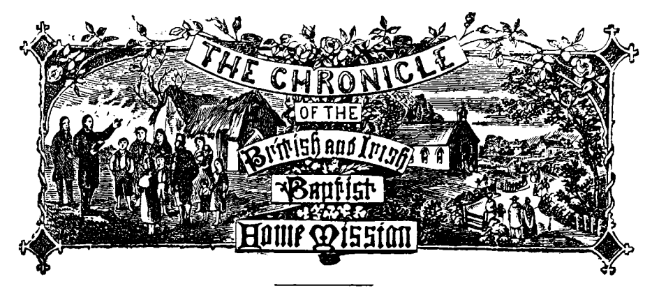
As the Chronicle is now sent to all Pastors of Baptis: Churches, the Committee hope that the Brethren will read extracts from 1T at the Monthly Missionary Prayer-meetings.