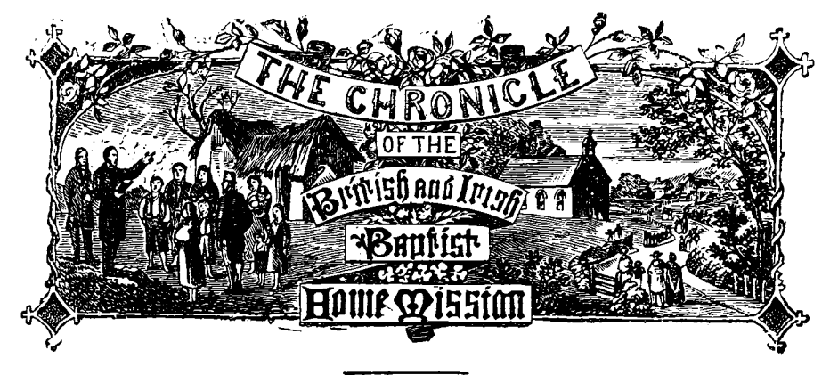
As the Chronicle is now sent to all Pastors of Baptist Churches, the Committee hope that the Brethren will read extracts from it at the Monthly Missionary Prayer-meetings.