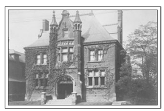
Toronto Bible College building, 1920 (from a postcard)

for twenty-five years the Bible school movement had made an important contribution to the life and work of the churches in the USA and Canada. They believed that they were called to fill a much larger place and do a greater work. While up to then the Bible school movement had not felt called to enter the field of academic or theological training, these leaders were convinced that in view of the